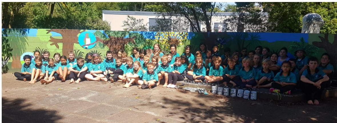
THE TIRAU PRIMARY RESENE MURAL MASTERPIECES ENTRY 2017